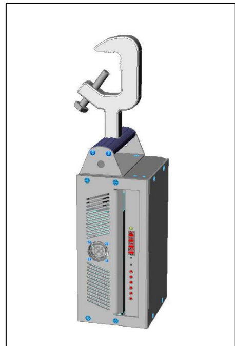
Figure 3 PDS-375 TR with C-Clamp

The PDS-375 can also be setup on a table, shelf, or other suitable flat surface. Be sure that adequate clearance for ventilation is maintained. Do NOT seal the PDS-375 up in a box or other un-cooled enclosure. If environmental protection is required, the unit may be installed in a suitable and properly ventilated NEMA 3R enclosure. Contact City Theatrical for details.